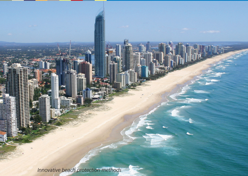
Innovative beach protection methods

Major events such as the Schoolies, Wintersun and Swell festivals, the Quicksilver Pro surfing competition, Surf Life Saving carnivals and regular markets give extra life and vitality to specific beaches.